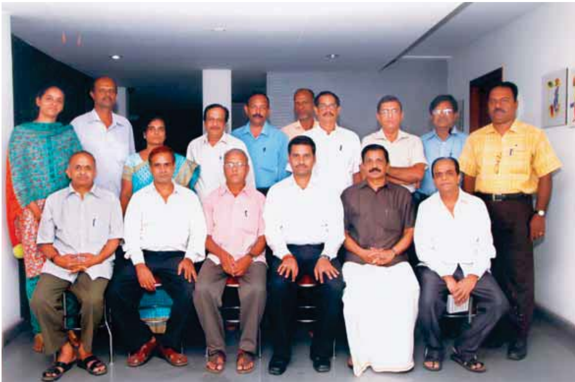
Our Officials with our Kerala Stockists 2011-12 meet held at Ernakulam