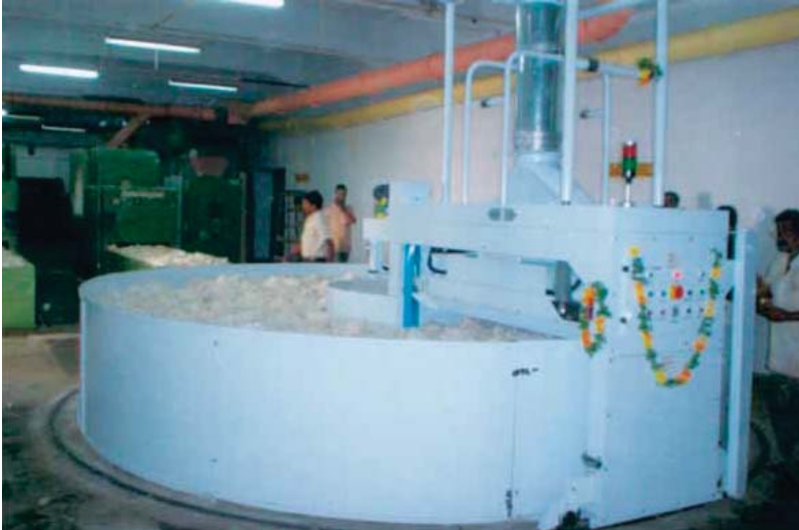
New Chinese Bale Plucker Machine installed at our Sudarsanam Spinning Mills, Rajapalayam